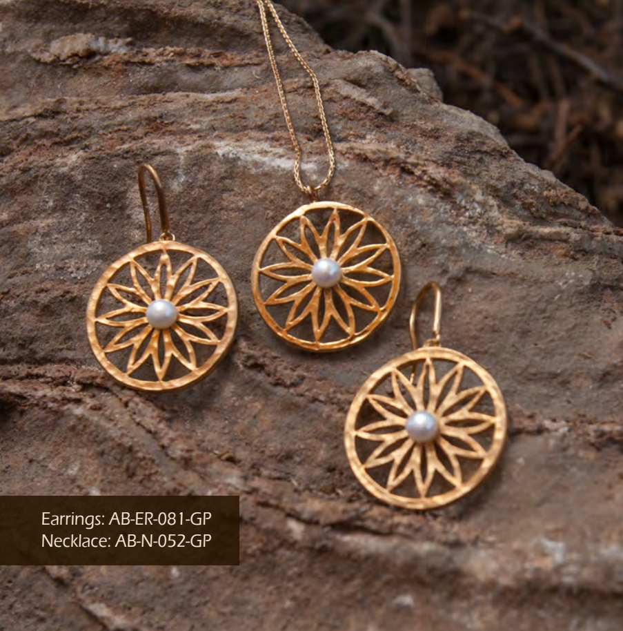
Earrings: AB-ER-081-GP Necklace: AB-N-052-GP